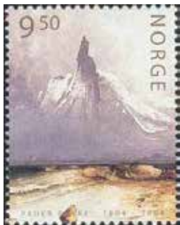
Fig. 1 The painting reproduced on the Norwegian postage stamp in 2004 is Balke's Fog over Stetind (1864).

Peder Balke 1804-1887 , Oslo, Kunstnernes Hus, 1954, no. 102