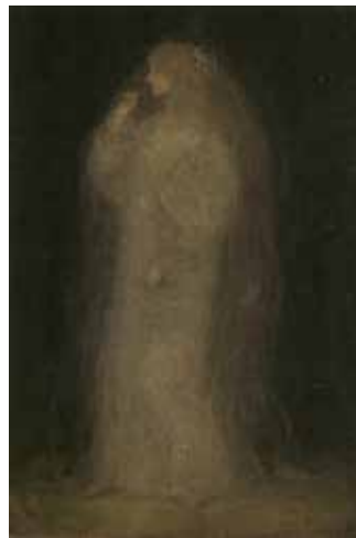
Fig. 1 Matthijs Maris, The Veiled Lady , oil on canvas, 50 x 34.5 cm, The Hague, Gemeentemuseum, inv. 0332299