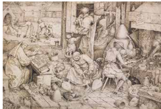
Fig. 1 Pieter Bruegel the Elder, The Alchemist , brown ink on paper, 308 x 452 mm, Kupferstichkabinett Berlin, inv. K.d.Z. 4399

In the present painting Jan Steen takes up the second of the two established ideas of the alchemist – the percep-