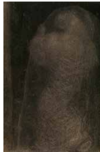
Fig. 2 Matthijs Maris, The Bride , charcoal on paper, 508 x 343 mm, Glasgow Museums, inv. 35/329