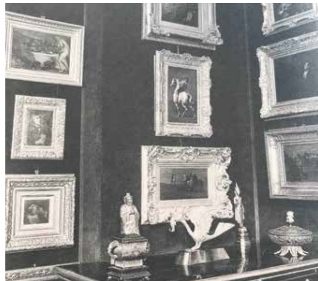
Fig. 1 View of the 'Daumier-Zimmer' in the Villa Fuchs in Berlin-Zehlendorf

The present, vertical-format painting is one of this series. It depicts a young horseman in short black trousers riding bareback and without reins on a gray horse. Horse and rider occupy almost the entire picture space.