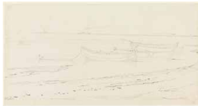
Fig. 1 Carl Blechen, Boats on the Baltic Shore , pencil on paper, 121 x 234 mm, Braunschweig, Herzog Anton Ulrich-Museum (R 675)

This drawing has a distinguished provenance. It was at one time in the most important of all collections of Blechen's works, namely the collection formed by the Berlin banker H. F. W. Brose. Brose acquired the sheet in 1853 at Blechen's estate auction. Theodor Fontane, writing in 1882 on the Brose collection, mentions the presence of some seventy oil paintings and seven large-format portfolios of drawings. This sheet was probably sold some time before 1928 since it does not figure in the catalog of the Carl Brose collection sale published by auctioneers Hollstein & Puppel when they dispersed the collection at auction on 8-10 November 1928 in Berlin.