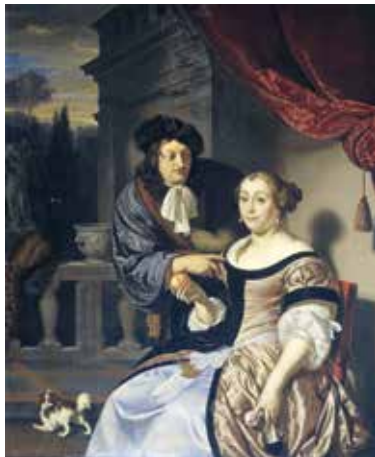
Fig. 1 Frans van Mieris, A Man and a Woman , 1678, oil on panel, 36 x 30 cm, Amsterdam, Rijksmuseum, inv. SK-C-184

Cornelis Hofstede de Groot, Beschreibendes und Kritisches Verzeichnis der Werke der hervorragendsten holländischen Maler des XVII Jahrhunderts , X, Stuttgart 1928, p. 16, no. 58 (as Frans van Mieris); Otto Naumann, Frans van Mieris the Elder 1635-81 , Doornspijk 1981, II, p. 131, no. B11.