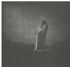
Edward Steichen (1879-1923), Balzac, Towards the Light, Midnight , 1908, direct carbon print, 36.5 x 48.2 cm