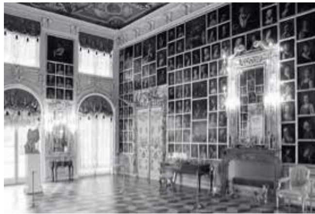
Fig. 1 Rotari Hall at Peterhof Palace, St. Petersburg

Pastels enjoyed exceptional popularity at the courts of Europe in the eighteenth century. The medium combined the vibrancy of drawing with the coloristic qualities of oil painting. The velvety surface was ideally suited to imitate the textures of skin and fabrics. Even in poor light, pastel color retained its extraordinary intensity. The leading eighteenth-century exponent of the medium was almost certainly Jean-Etienne Liotard (1702-89), whom Rotari met in Vienna when both artists were working on commissions for the Imperial Court. Since only very few of Rotari's pastels have survived, this masterly example, preserved in its original frame, is of unquestionable rarity.