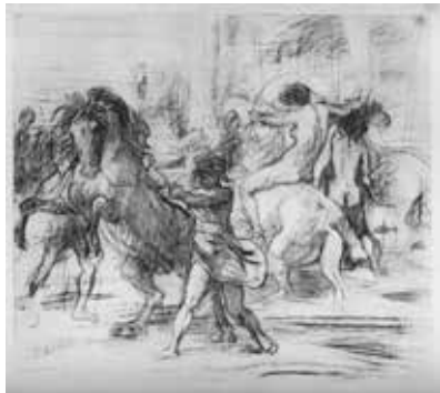
Fig. 1 Hans von Marées, Battle of the Amazons , 1887, red chalk on paper, 45 x 40 cm (Meier-Graefe no.1000)

PROVENANCE: Private collection, Switzerland