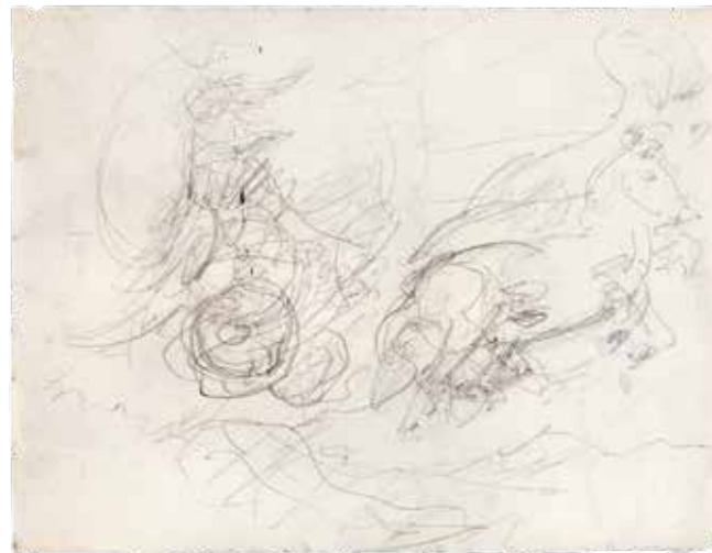
Fig. 1 Lovis Corinth, Phaethon and the Sun Chariot , pencil on paper, 28 x 21.5, verso of the Self-Portrait

The self-portrait genre is a leitmotif throughout Lovis Corinth's œuvre . He produced an extensive body of self-portraits which show many selves, alternately displaying disarming candor, or sensitivity and tenderness. The self-portraits embody a struggle for veracity and offer a wealth of insights into Corinth's multifaceted artistic personality. Corinth's self-portraits are invariably a deep reflection on mortality. The self-portraits he executed before his stroke in 1911 demonstrate a certain self-confidence, as in the celebrated half-figure self-portrait of 1896 in which he juxtaposes a frontal view of his burly frame with a skeleton used as a piece of studio equipment (Fig. 1). But the tone is quite different in the present watercolor, which certainly post-dates the 1911 stroke and is dateable to circa 1916. The bombastic self-dramatization of the earlier work has given way to a sense of deep-seated insecurity. Corinth conveys an impression of fragility: partially paralyzed by