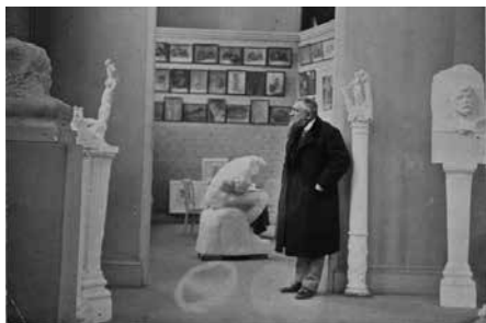
Fig. 1 Auguste Rodin at the Pavillon de l'Alma exhibition in 1900.

Exposition Rodin , Paris, Pavillon de l'Alma, June 1 - November 1, 1900; 2 Exposition d'ensemble du statuaire A. Rodin, 88 sculptures, 74 cadres dessins , Prague, Kinského Zahrada, May 10 - July 15, 1902; 3 Drawings of Importance from 1860 to 1960 , London, Roland, Browse & Delbanco, 1967, no. 13.