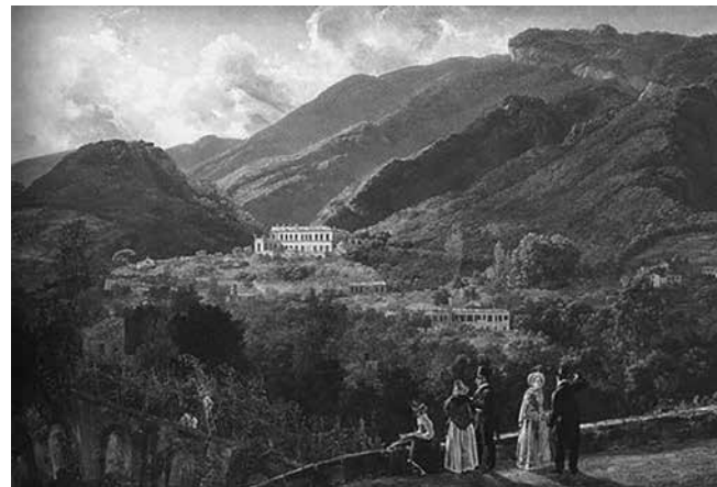
Fig. 1 Johan Christian Clausen Dahl, The Villa Quisisana seen from a Terrace, with Members of the Royal Household , 1820, Naples, Museo di Capodimonte (inv. 1388)

This painting was one of the first works Dahl com- pleted on his arrival. It was commissioned by the Danish Princess to mark her husband's birthday on 18 Septem- ber. It depicts the view the royal couple enjoyed looking north from the terrace of the Villa towards the Bay of Naples. To add grandeur to his depiction of the land- scape, Dahl selected an elevated vantage point on the ridge of Monte Coppola just behind the Villa. The towns