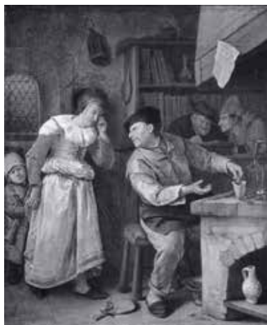
Fig. 2 Jan Steen, The Alchemist , oil on canvas, 34 x 28.5 cm, Städel Museum, Frankfurt, inv. no. 898

In his contribution to the catalogue of the major exhibition of Steen's work at the National Gallery of Art in Washington in 1996, Lyckle de Vries defines Steen's oeuvre as follows: "Even before Theophile Thore-Bürger characterized Jan Steen as a 'painter of comedies' in 1858, many people had recognized humor and story-telling as the nucleus of his work. More than once he was called the 'Moliere of painters'. All the means available to a painter were made subservient to that narrative interest. The pictorial realization, which often refined but also occasionally careless in the details, is invariably at the service of the content. That content, seldom summarized in forthright inscriptions, is a succession of familiar lessons in living wisely: Ten Commandments and a thousand prohibitions. But this is not to characterize Jan Steen as a disgruntled moralist. He was more of a cabaret artist, comedian, or comic play writer who confronted his public with the old values and truths it loved, expressing himself not in words but in paint. The moralization, however, takes on an unexpected topicality as a result of Steen's provocative presentation. The choice between good and evil is once again as clear as day, and the audience's position no less so. The spec-