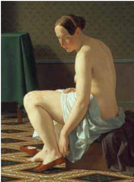
Fig. 1 Christoffer Wilhelm Eckersberg, Female Nude Putting on her Slippers , 1843, Copenhagen, Ny Carlsberg Glyptotek, inv. 786 b.

Den nøgne guldalder: Modelbilleder, C.W. Eckersberg og hans elever , Copenhagen, Den Hirschsprungske Samling, 1994, no. 60, repr. p. 131.